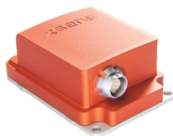
MTi encased: 57x42x23.5 mm, 52g, 9-pins push-pull connector